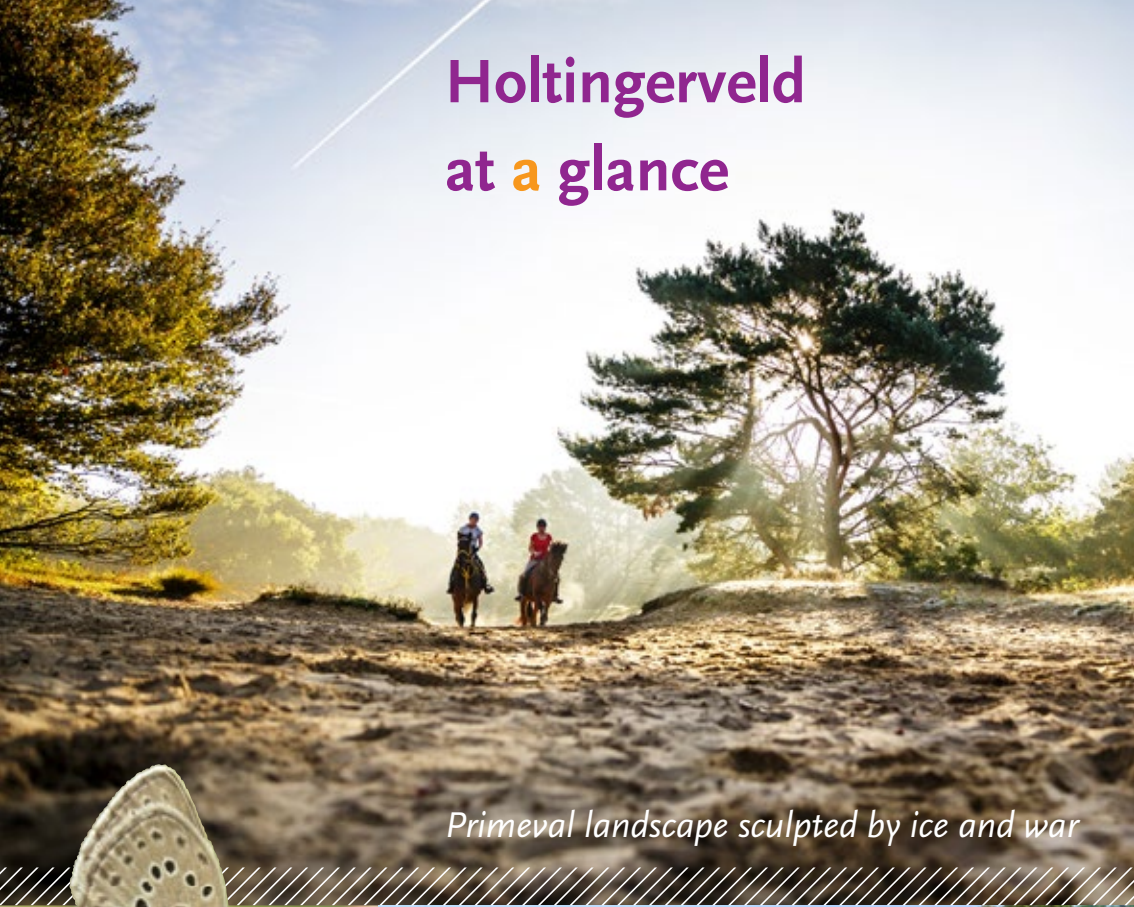
Primeval landscape sculpted by ice and war